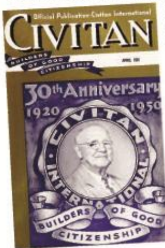
Cover of 1950 Civitan Magazine, celebrating the 30th anniversary of becoming an International Club

The club published a weekly newsletter, Civitates , which included biographies of members, inspirational features and Club information. The April 1920 Civitates included an article offering $100 in gold for the best submission of a club song. The article called for a "...snappy, tuneful, zippy song that Builders of Good Citizenship can sing at their luncheons and national conventions". Typifying Progressive Era activism, Birmingham Civitans determined to go beyond their routine business and professional activities by initiating unified and systematic community project.