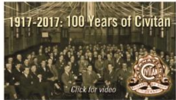
Click above to see the informative and inspiring online video of Civitan's 100 years at http://civitan.org/heartland/100video.html

They participated in early Club projects that ranged from encouraging greater voter participation through payment of poll taxes to supporting the Allied war effort in Europe with Red Cross and Liberty Loan drives and campaigns for the Fatherless Children of France. The Club was receiving inquiries from other southern cities where professionals learning of the work of the organization, wanted to establish comparable clubs. Lacking neither vision or confidence, on March 13 1920, members of the Birmingham Club filed incorporation papers at the Jefferson County Courthouse- thus creating the International Association of Civitan Clubs.