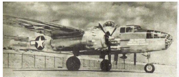
DURING WORLD WAR II, THE SHADYSIDE CIVITAN CLUB IN BIRMINGHAM HELD SO MANY SUCCESSFUL BOND DRIVES THAT THE ARMY AIR FORCES NAMED A B-25 IN THE CLUB'S HONOR.

The 1943 convention amended the constitution to allow local clubs to decide independently on use of the classification system were by only one Lawyer, one Doctor, and one Preacher was allowed in each Club. Just as that decision permitted some local club “discrimination” – that related to race. [That same Year] with “white” removed, the 1943 convention issued an invitation to a “Civitas” club in Mexico to consider an official connection with [Civitan International]. This Latin American prospect engendered great excitement for CI members, although an official relationship with clubs in Mexico did not occur for two decades.